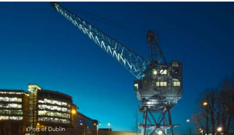
Port of Dublin