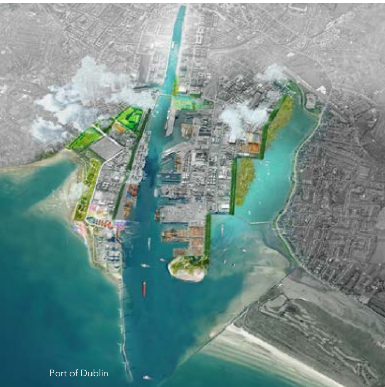
Port of Dublin